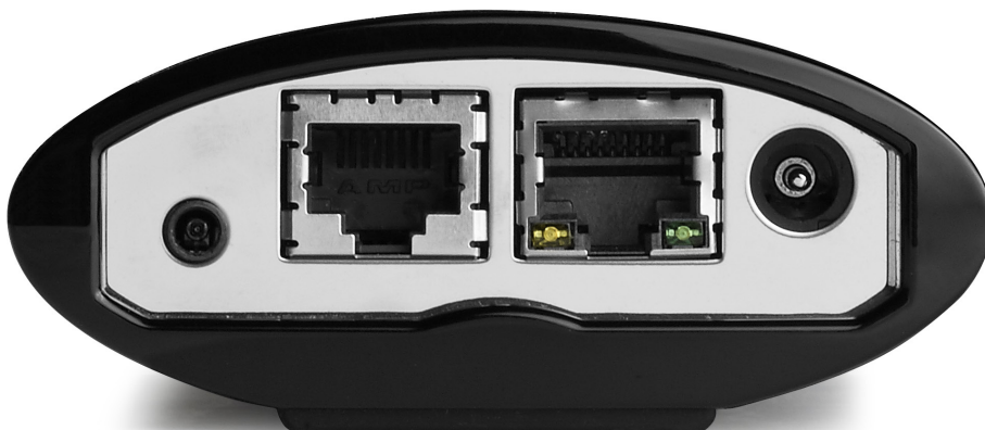
Rear panel showing connections. (L to R): Audio Outputs (3.5mm analogue/optical S/PDIF jack); SpeakerLink RJ45 output; Digital Media Network RJ45 connection; power socket.

An RJ45 SpeakerLink output allows the unit to be connected direct to a pair of Meridian DSP Loudspeakers or a component, such as the Audio Core 200, with a SpeakerLink input. When connected via SpeakerLink to the Audio Core 200 or loudspeakers such as the DSP3200 and DSP3300, the SpeakerLink destination powers the Media Source 200. An external power supply is also included for operation where the Media Source 200 is not connected to a compatible SpeakerLink product.