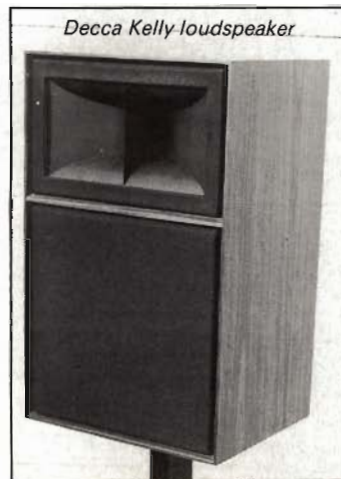
Decca Kelly loudspeaker

Other items include the Interface range of accessories from Holland, the well regarded Jecklin Float headphones (now in a revised version), various exotic interconnects and a limited number of the famous, and highly regarded in its time, Decca/Kelly loudspeaker, with its ribbon horn unit and 200mm bass driver. At £195/pair, compared with the list price of £460, this is a bargain indeed for devotees. Presence Audio, Eastland House, Plummers Plain, Horsham, West Sussex RH13 6NY.