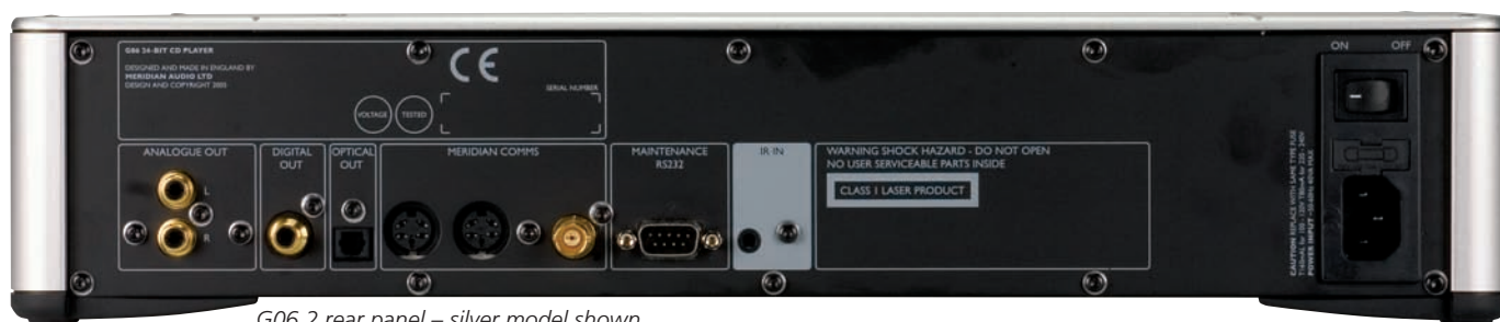
G06.2 rear panel – silver model shown