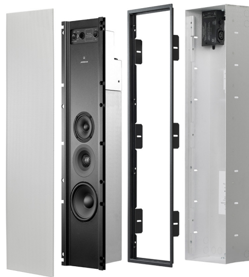
DSP730 shown with grille and RF500 rough-in box

The DSP730 can be combined with the Meridian DSW600 in-wall subwoofer to produce a full-range, two-box solution.