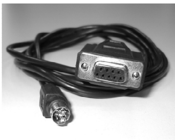
F80 firmware-update lead Meridian stock code: SP5478AA

If a firmware update is required, the firmware can be loaded from a PC connected to the F80 using the appropriate lead (pictured). This lead is available to authorised distributors from Meridian Audio Limited.