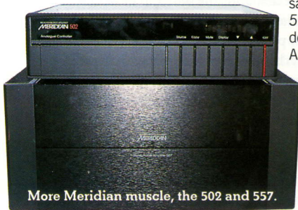
More Meridian muscle, the 502 and 557.