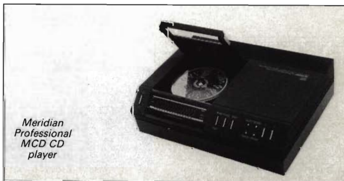
Meridian Professional MCD CD player

which include a new digital absolute phase correction system, high performance integrator and analogue filtering stage. There is a separate power transformer and regulated power supply system, plus an improved master oscillator claimed to produce 40dB less jitter and modulation giving 16-bit resolution under dynamic music conditions. A digital output is provided.