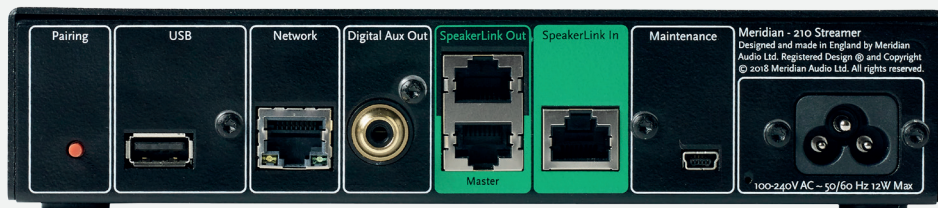
REAR PANEL LAYOUT

Master Quality Authenticated (MQA) is a revolutionary end-to-end technology that delivers master quality audio in a file that’s small enough to stream or download.